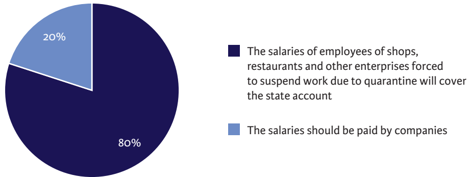
Figure 3. Redistribution of salaries in the Czech sphere of services

main innovation is the interest-free COVID Loan to pay salaries for periods of the business downtime.