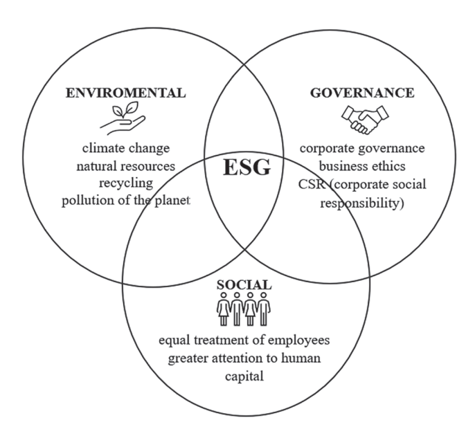
Figure 2. ESG dimensions