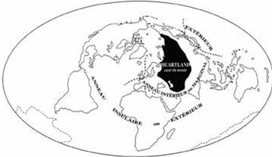
Figure 1. Mackinder's Heartland Theory Published in 1904

true, the British Empire's sea power will be destroyed 4 . Thus, Mackinder's Eurasia heartland geopolitical theory just reflected and theorised the British geopolitical foreign policy in Europe.